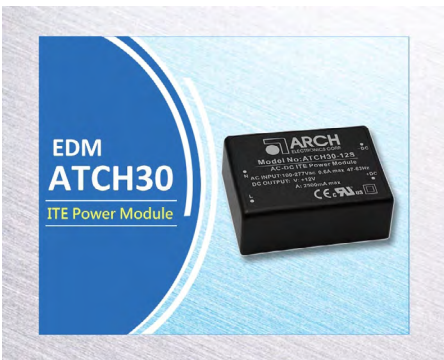
30W AC/DC Module 90-305 VAC input ; -40°C to +85°C