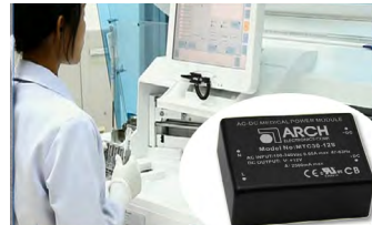
Automatic Biomedical Analyzer