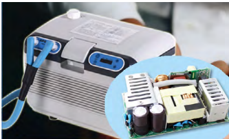
Patient Warming System