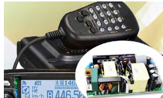
Digital Car Station