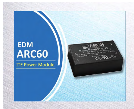
Fully encapsulated AC/DC Power for Automation, Industry, ...