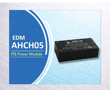
Cost effective 5W AC/DC power offers extended temperature range with universal input range