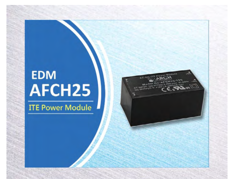
AC/DC ITE Power Module 25 Watt