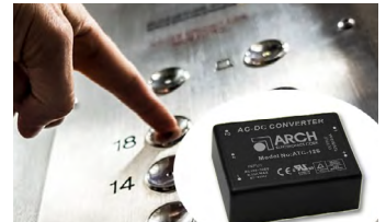
Elevator Control Board