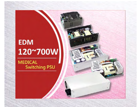
120-700W Medical PSU Ultra Compact Size