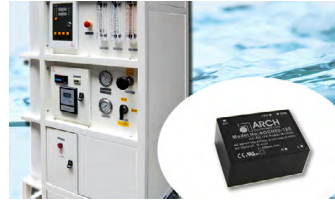
Drinking Fountain Monitor