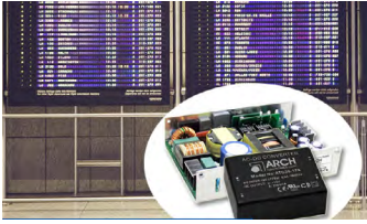
Railway Info Board