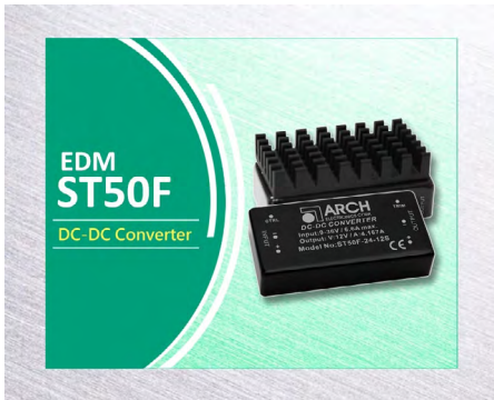
Up to 91%, 50W isolated DC-DC converter