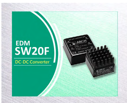
Wide input 20W DC/DC converters in just 1.0" x 1.0" x 0.45"