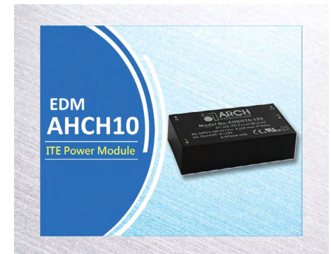
10W AC/DC power, enhanced mains input conditions