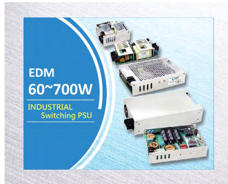
60-700W PSU Open Frame / U-bucket / Enclosed