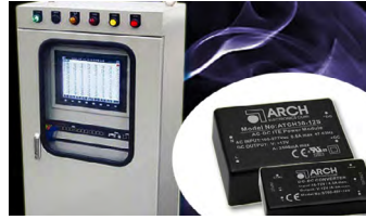
Gas Leak Detection