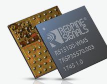
WLCSP (WMS) 3.51 mm X 3.60 mm