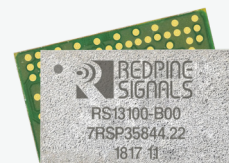
LGA Module (B00) 4.63 mm X 7.90 mm