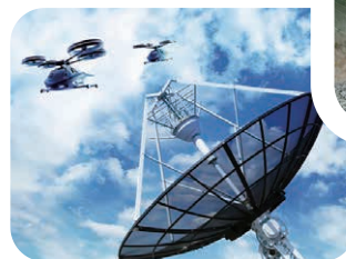
v Robotic Control