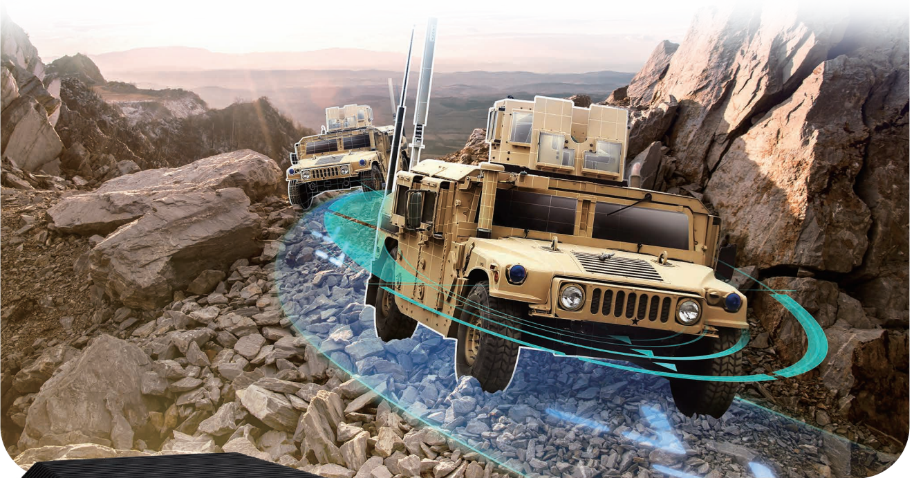
^ Advanced Driver Assistance Systems (ADAS)

Intel® Core™ i9/i7/i5/i3 Processor (14th Gen) Workstation-grade Fanless High Endurance System