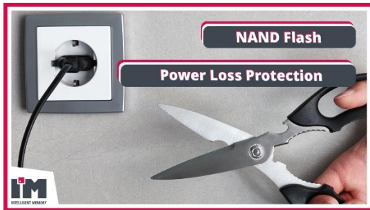
NAND Flash Power Loss Protection (PLP)