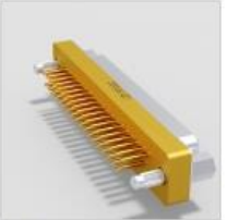
Filter Press Fit Assembled