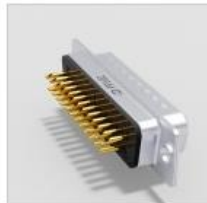
Filter Solder Cup