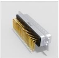
Filter Solder Pin 90°, 7.18