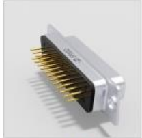
Filter and Pi-Filter Solder Pin