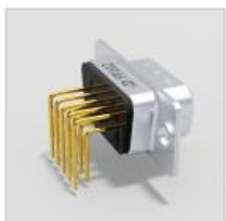
Filter Solder Pin 90°, 9.4