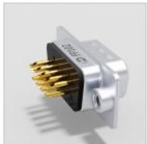
Filter Solder Cup Assembled