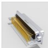
Filter Solder Pin 90°, 8.4 Assembled