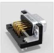
Filter Solder Pin 90°, 9.4 Assembled