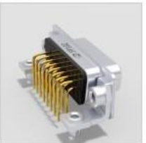
Filter Solder Pin 90°, 7.18 Assembled