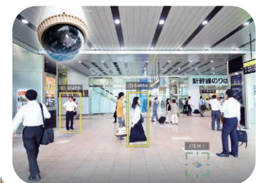
▲ Public Security