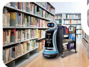
▼ Mobile Robots