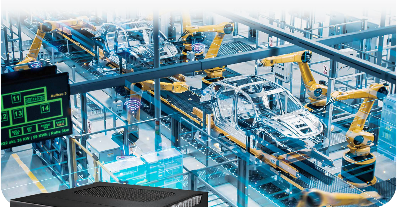
▲ Digital Factory

13th Gen Intel® Core™ i9/i7/i5/i3 Processor Compact Embedded Computing System