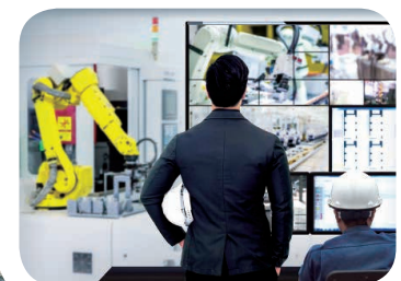
^ Factory Automation