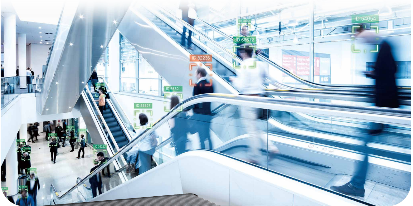
^ AI Surveillance

24-core Foxconn Cortex-A53 MPU with Hailo/Lightspeur AI Accelerator Card Arm-based Edge AI Computing System for Intelligent Surveillance