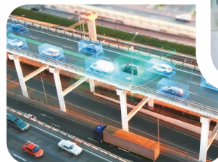
v Traffic Vision