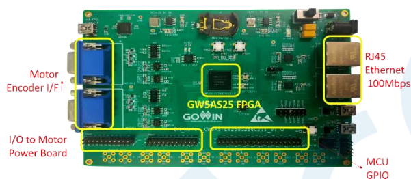
Fig. 3: the DK_MOTOR_GW5AS-EV25UG256_V1.0 enables rapid development of a multi-motor control system

Design engineers can experiment with the operation of the GW5AS25 by using a development kit, the DK_MOTOR_GW5AS-EV25UG256_V1.0 (see Figure 3). This kit includes a current control loop IP, an encoder controller, an industrial Ethernet interface, an ADC implemented in the FPGA, position/speed control loops, and Ethernet stack implemented in the MCU.