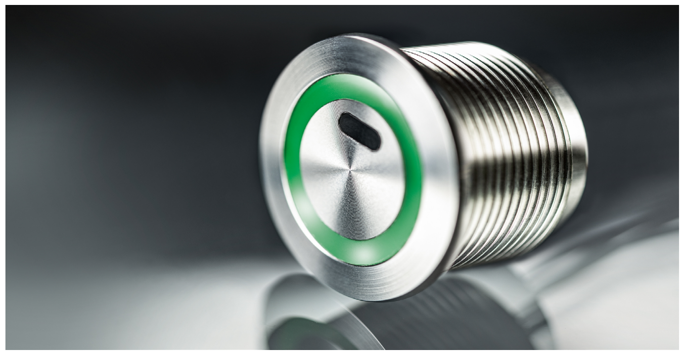
SCHURTER TTS: high-precision, touchless Metal Line switch in optical ToF technology (Time of Flight)

Please, do not touch! Because that doesn't have to be the case at all. A new generation of switches for touchless switching has been developed for exactly this purpose. Switching without touching. Switching without contaminating the surface with potentially harmful germs, viruses or bacteria. How do these switches work and what are they capable of?