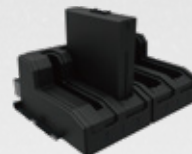
4-bay Battery Charger