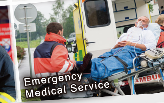
Emergency Medical Service