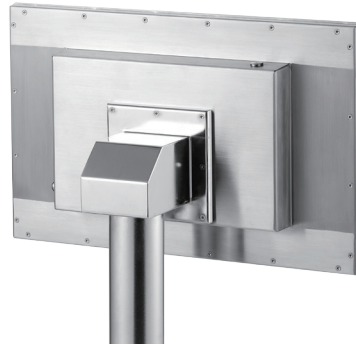
Stainless steel housing for full IP65/IP69K