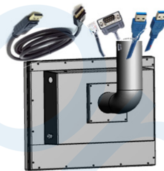
Water and dust proof is easy and reliable with standard cable connectors. No extra cost needed.