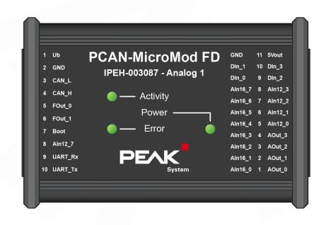
Figure 1: Top view PCAN-MicroMod FD Analog 1 with pin assignment