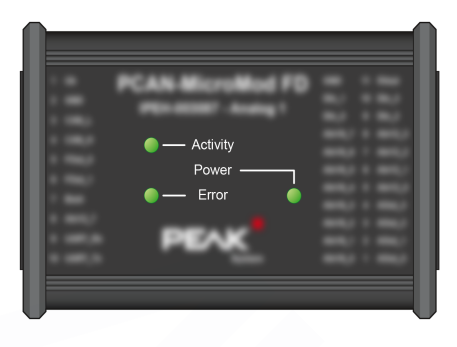
Figure 4: LEDs on the PCAN-MicroMod FD Analog 1