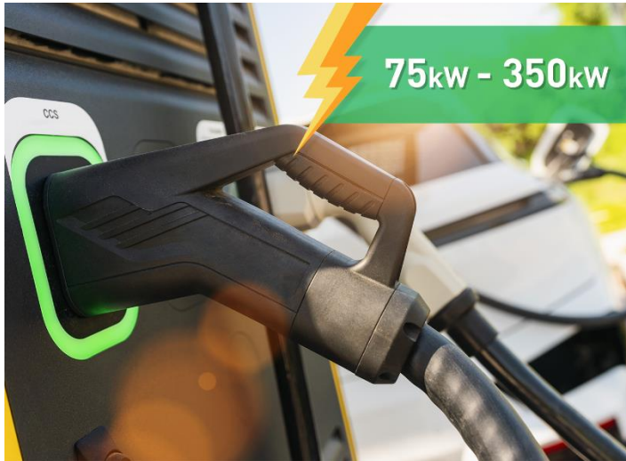
Figure 1: DC Fast-Charge Stations

This use case examines the application of the MPQ18913 in DC fast-charge (DCFC) stations