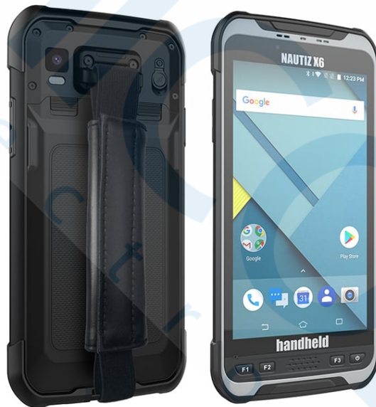
NAUTIZ X6 HAND STRAP