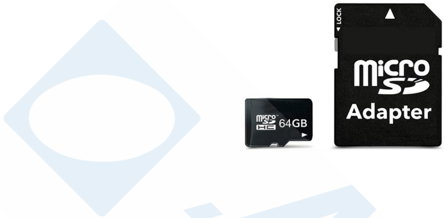
MEMORY CARD 64 GB