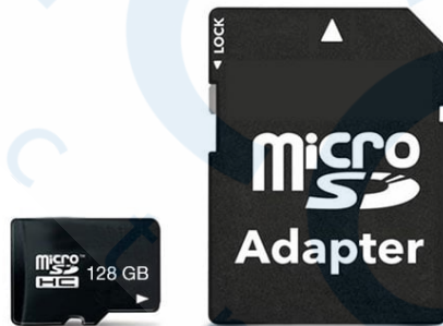
MEMORY CARD 128 GB