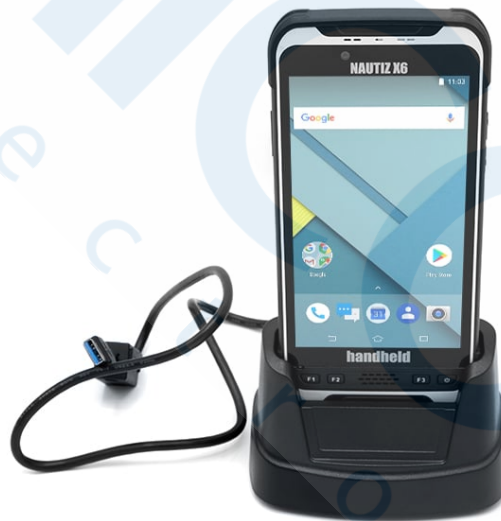
NAUTIZ X6 DESKTOP DOCK