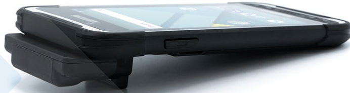
NAUTIZ X6 LF RFID 134,2 KHZ