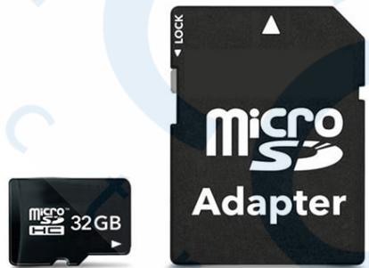
MEMORY CARD 32 GB