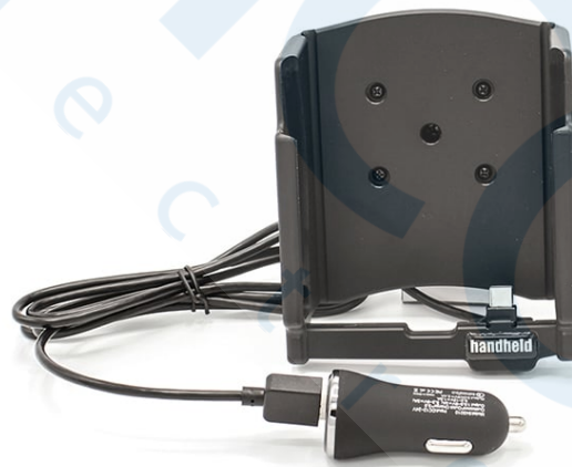
NAUTIZ X6 VEHICLE CRADLE