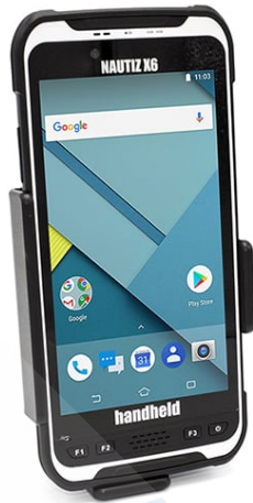
NAUTIZ X6 PASSIVE CRADLE