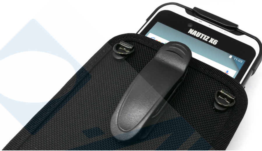
NAUTIZ X6 CARRY CASE WITH BELT CLIP