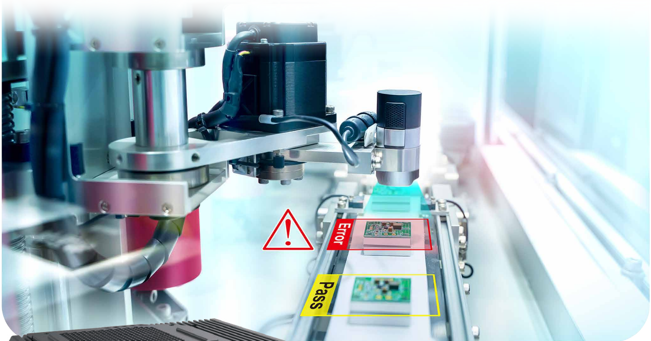
^ Factory Automation

AMD Ryzen™ PRO 5000 Series Processor (Cezanne) Embedded System