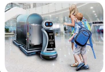
^ Autonomous Robot