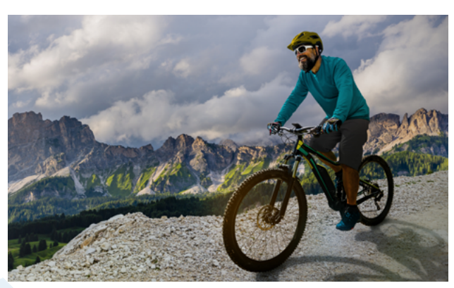
E-Bikes and Pedelecs