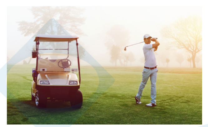
Golf caddies and trolleys