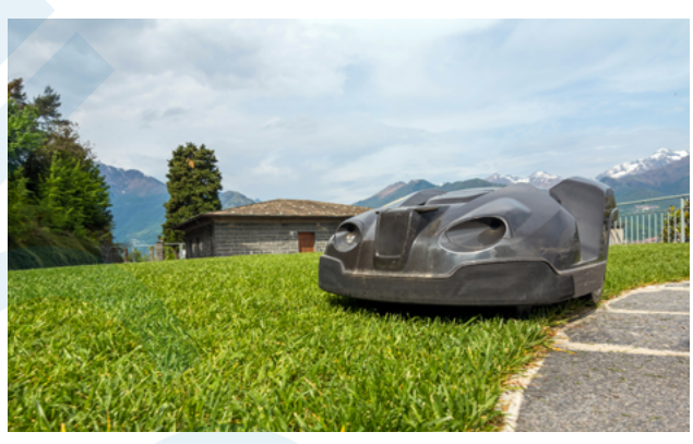
Robot lawn mowers and riding lawn mowers