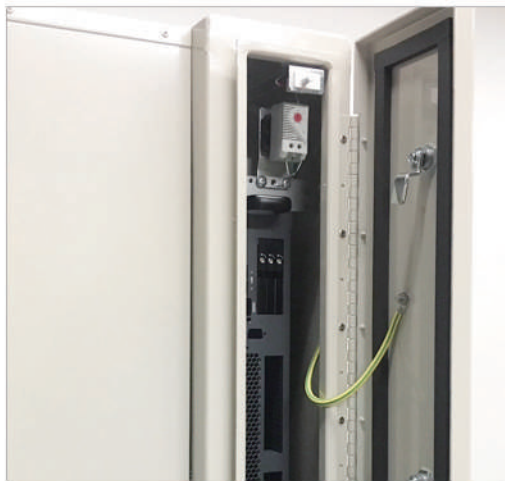
ADLINK Edge & AI Server installed in Charles NEMA 4X (IP65) Enclosure

This partnership provides the industry's first outdoor pole mountable AI MEC solution. The solution is a key cost-effective element to enable smart city and advanced community use cases. This includes a multitude of locate anywhere platforms for processing data to enable autonomous vehicles becoming a reality. Placing micro-edge compute platforms in close proximity with 5G radios can further enable AI and machine learning applications to emerge by allowing fast enough data processing to allow users to conduct interactions in real time. There are a growing number of new smart city services and applications that become feasible with compute resources co-located with low latency 5G radios: from smart parking to anomaly recognition to enhanced entertainment. Communities will become safer and more enjoyable.