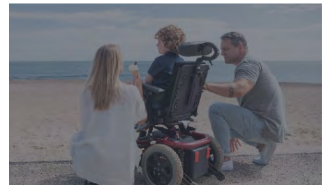
Digitally Controllable Drives