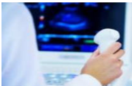
Medical & Healthcare