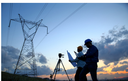
Telecom & Networking