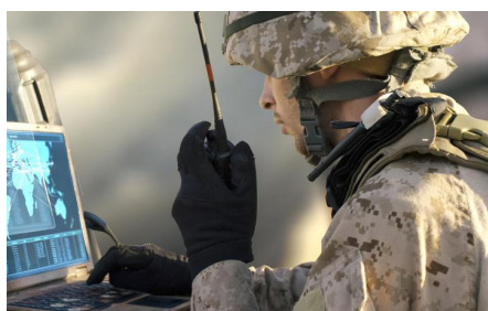
Military & Aerospace