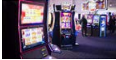
ENTERTAINMENT & GAMING