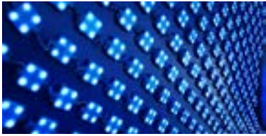
LIGHTING & ILLUMINATION