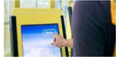
KIOS, POS & DIGITAL SIGNAGE