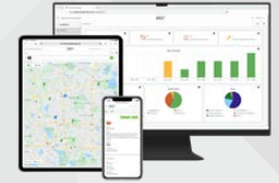
Manage this device with Digi Remote Manager