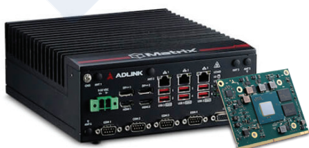
Figure 2. The ADLINK MVP-5200-MXM computer and MXM-AXe GPU module.

Hyper Compute, which is part of Intel Deep Link technology, intelligently balances compute workloads across CPU and GPU resources. This underlying mechanism enables applications to harness availability and maximize utilization of Intel hardware capabilities to speed up computations. Similarly, the Intel® OpenVINO™ inference engine is capable of combining CPU, integrated GPU, and discrete GPU resources available on an Intel platform such as the ADLINK MVP-5200 series computer to support AI workloads. The OpenVINO solution stack features an open, non-proprietary programming model and draws on the unmatched Intel ecosystem of hardware and software building blocks.