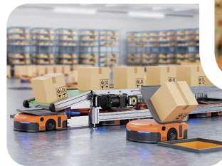
Autonomous Mobile Robots