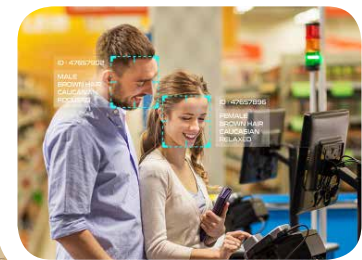
Real-Time Video Analytics