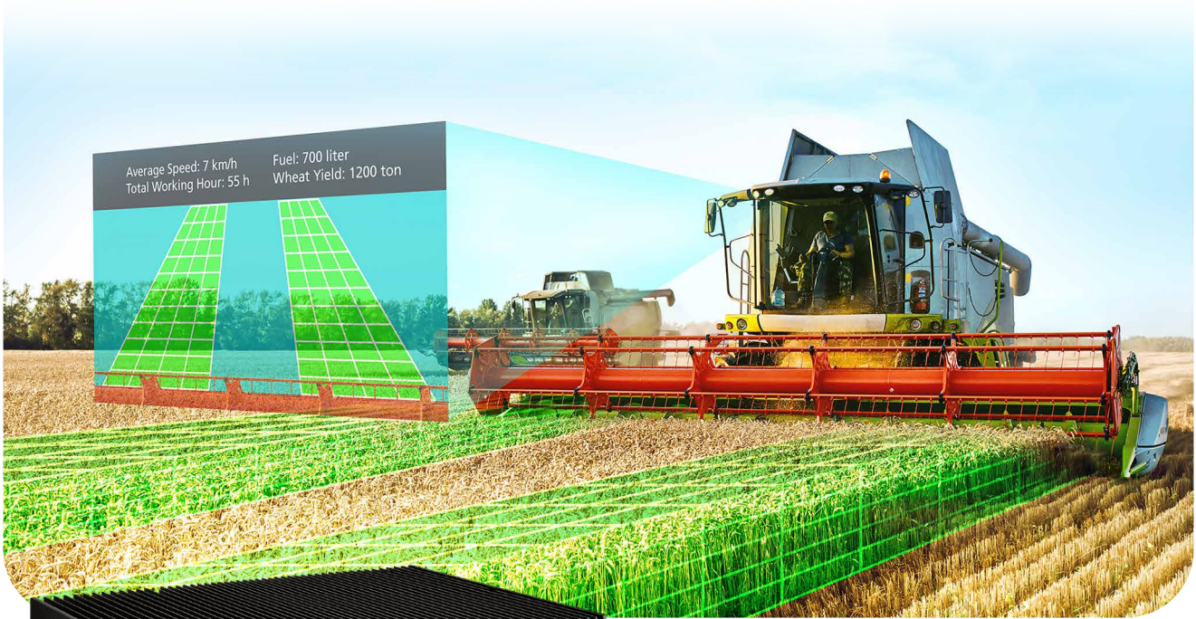
Automated Agricultural Machinery

NVIDIA® Jetson AGX Orin™ Embedded AI Computing System