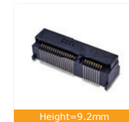
Height=9.2mm 119A-92A00-R02 Accessories 119A-LATCH-92, Dual Latch 119A-NUT-92-R02, Nut 119A-SCREW-R02, Screw