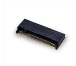
A Key H=2.1mm 123A-21A00 H=3.0mm 123A-30A00 H=4.0mm 123A-40A00 H=5.8mm, Gen4 123A-85AA0 Accessory Single Latch for 3.0 H 123A-30L1 Single Latch for 4.0 H 123A-40L1