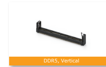
DDR5, Vertical Standard, H=14.7mm 126B-190A00 Reverse, H=14.7mm 126B-190A10