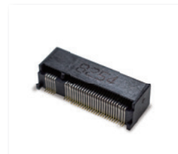
E Key H=2.1mm 123A-21E00 H=3.0mm 123A-30E00 H=4.0mm 123A-40E00 H=5.8mm, Gen4 123A-58E01 H=8.5mm, Gen4 123A-85EA0 Accessory Single Latch for 3.0 H 123A-30L1 Single Latch for 4.0 H 123A-40L1 Single Latch for 5.8 H 123A-58L1