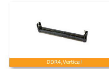
DDR4, Vertical Standard, H=14.7mm 124B-150A02 Reverse, H=14.7mm 124B-150A12