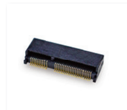
B Key H=2.1mm 123A-21B00 H=3.0mm 123A-30B00 H=4.0mm 123A-40B00 H=5.8mm, Gen4 123A-58B01 H=8.5mm, Gen4 123A-85BA0 Accessory Single Latch for 3.0 H 123A-30L1 Single Latch for 4.0 H 123A-40L1 Single Latch for 5.8 H 123A-58L1