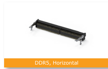
DDR5, Horizontal Standard, H=4.0mm 126A-40A00 Standard, H=5.2mm 126A-52A00 Standard, H=8.0mm 126A-80A00 Standard, H=9.2mm 126A-92A00 Reverse, H=4.0mm 126A-40A10 Reverse, H=5.2mm 126A-52A10 Reverse, H=8.0mm 126A-80A10 Reverse, H=9.2mm 126A-92A10