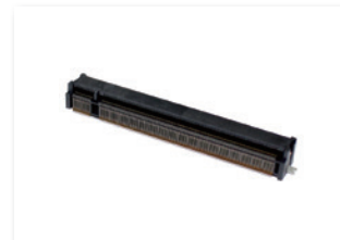
MXM2, 230 pin H=7.8mm 125A-78C00