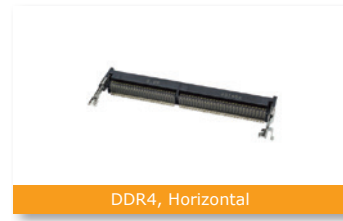
DDR4, Horizontal Standard, H=4.0mm 124A-40A03 Standard, H=5.2mm 124A-52A03 Standard, H=8.0mm 124A-80A03 Standard, H=9.2mm 124A-92A03 Reverse, H=4.0mm 124A-40A13 Reverse, H=5.2mm 124A-52A13 Reverse, H=8.0mm 124A-80A13 Reverse, H=9.2mm 124A-92A13