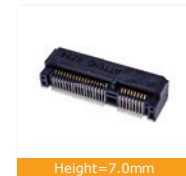
Height=7.0mm 119A-70A00-R02 Accessories 119A-NUT-70-R02, Nut 119A-SCREW-R02, Screw