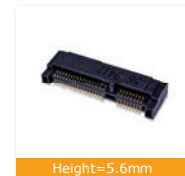
Height=5.6mm 119A-56A00-R02 Accessories 119A-56LATCH, Single Latch 119A-LATCH-56, Dual Latch 119A-NUT-56-R02, Nut 119A-SCREW-R02, Screw