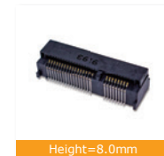
Height=8.0mm 119A-80A00-R02 Accessories 119A-LATCH-80, Dual Latch 119A-NUT-80-R02, Nut 119A-SCREW-R02, Screw