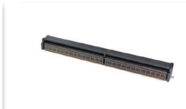
MXM3, 314 pin H=7.8mm 125B-78C00