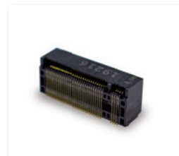
M key H=2.1mm 123A-21M00 H=3.0mm 123A-30M00 H=4.0mm 123A-40M00 H=5.8mm, Gen4 123A-58M01 H=8.5mm, Gen4 123A-85MA0 Accessory Single Latch for 3.0 H 123A-30L1 Single Latch for 4.0 H 123A-40L1 Single Latch for 5.8 H 123A-58L1