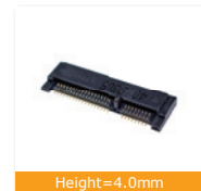
Height=4.0mm 119A-40A00-R02 Accessories 119A-40LATCH, Single Latch 119A-LATCH-40, Dual Latch 119A-NUT-40-R02, Nut 119A-SCREW-R02, Screw