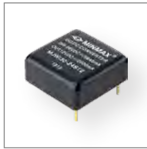
10-30W • 1" x 1" PACKAGE