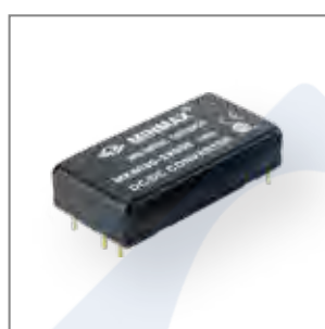
40-50W • 2" x 1" PACKAGE