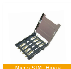
Micro SIM, Hinge