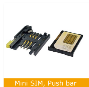
Mini SIM, Push bar

6 Pin, H=2.6mm 115C-AC00-01 8 Pin, H=2.6mm 115C-BC00-01 6+2 Pin, w/CDS, normal close 115J-ACC0 6+2 Pin, w/CDS, normal open 115J-AC00 8+2 Pin, w/CDS, normal close 115J-BCC0 8+2 Pin, w/CDS, normal open 115J-BC00