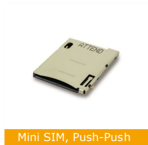
Mini SIM, Push-Push

6+2 Pin, SMT, with switch 115A-ADA0-R02 8+2 Pin, SMT, with switch 115A-BDA0-R01