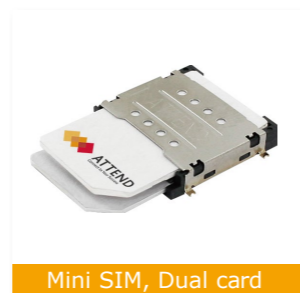
Mini SIM, Dual card