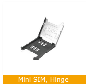
Mini SIM, Hinge

Plastic Hinge, 6 Pin 115B-AAA0-R01 Plastic Hinge, 8 Pin 115B-BAA0-R01 6+2 Pin, with switch 115F-AAA2