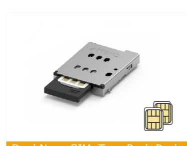
Dual Nano SIM, Tray-Push Push

Lock w/Switch, G/F 115U-B100 Accessory Tray, PC+ABS, Black 115U-T003