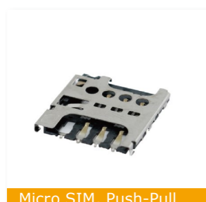
Micro SIM, Push-Pull