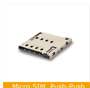
Micro SIM, Push-Push