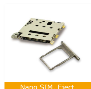
Nano SIM, Eject

with Tray, Top Mount, H=1.35mm 115S-ACA0