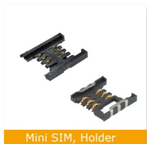
Mini SIM, Holder

6 Pin, H=2.6mm 115C-AC00-01 8 Pin, H=2.6mm 115C-BC00-01 6+2 Pin, w/CDS, normal close 115J-ACC0 6+2 Pin, w/CDS, normal open 115J-AC00 8+2 Pin, w/CDS, normal close 115J-BCC0 8+2 Pin, w/CDS, normal open 115J-BC00