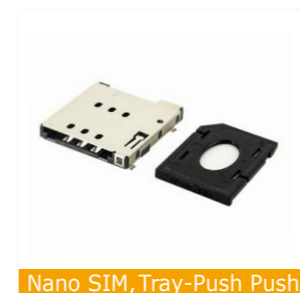
Nano SIM, Tray-Push Push

115U-A101 Accessory Tray, Length=16.25 mm 115U-T001