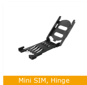
Mini SIM, Hinge

6+2 Pin, SMT, with switch 115A-ADA0-R02 8+2 Pin, SMT, with switch 115A-BDA0-R01