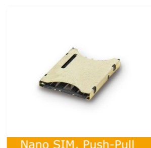
Nano SIM, Push-Pull