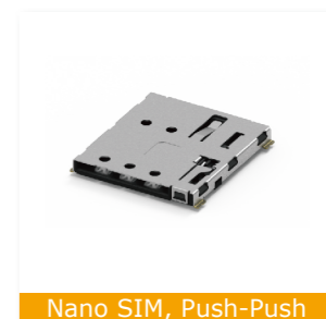
Nano SIM, Push-Push

115U-A101 Accessory Tray, Length=16.25 mm 115U-T001